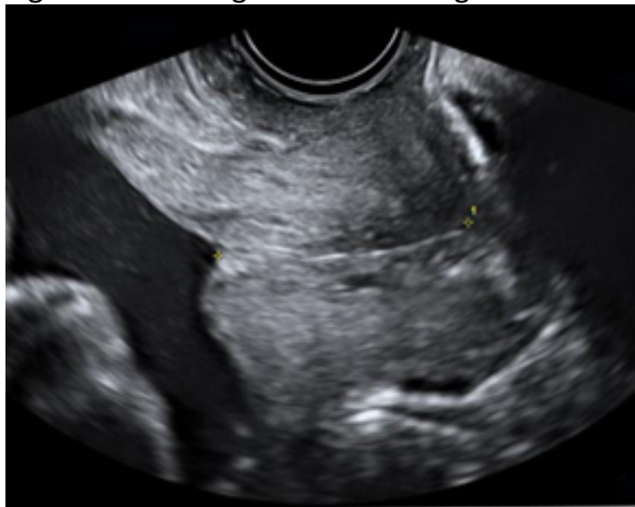
Figure 3. Transvaginal cervical-length measurement

Dynamic cervical shortening- examination time 3 minutes and/or suprapubic/fundal pressure.